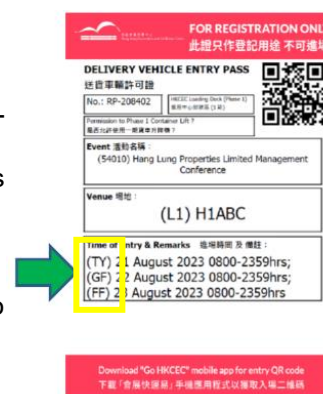
e-Vehicle Permit Sample (For Ref only)